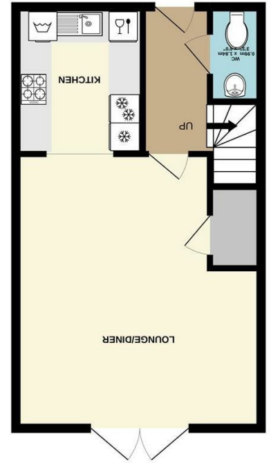
1ST FLOOR (419 sq.ft.) approx.